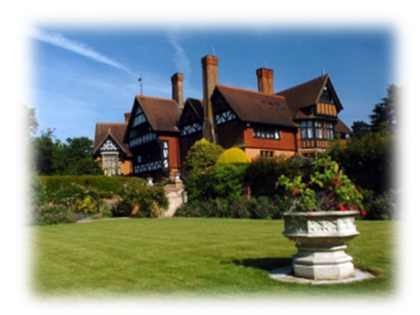
Best Western Plus Grim's Dyke Hotel Old Redding Harrow Weald Middlesex, HA3 6SH

Stanmore (Jubilee) 5 minute taxi ride. Harrow on the Hill (Metropolitan) 10 minute taxi ride. Harrow and Wealdstone (Bakerloo and Main line trains) 5 minute taxi ride.